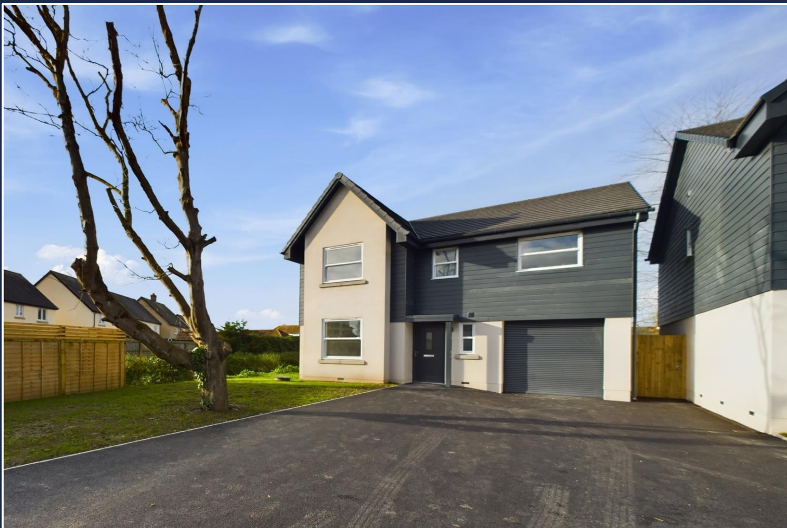
The Hawthorns, 1 Ham Mews, Old Bristol Road, East Brent, Somerset, TA9 4HX